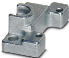
Panel mounting flange for HEAVYCON-ADVANCE TMS housing with screw locking

Please be informed that the data shown in this PDF Document is generated from our Online Catalog. Please find the complete data in the user's documentation. Our General Terms of Use for Downloads are valid ( http://phoenixcontact.com/download )